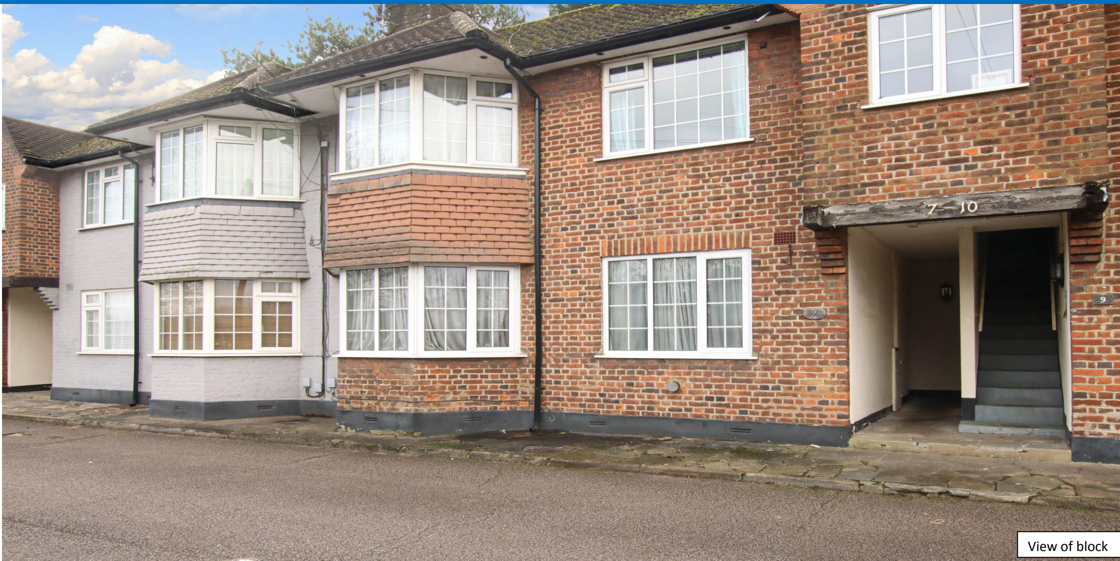
View of block